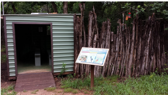
Entrance to Blind